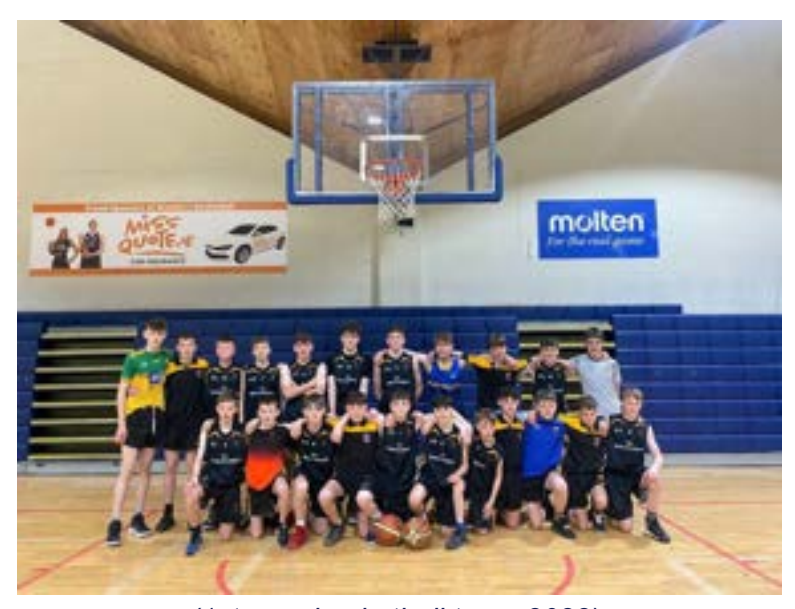
(1st year basketball team 2022)

We would like to congratulate the First Year Basketball Panel on their many successes this season. The team were unbeaten in all games to date and are both regional champions and All-Ireland Semi-Finalists. This is a fantastic achievement for the panel in their first year of playing basketball for the school and their hard-work, diligence and positive attitude is reflected in the successes mentioned above.