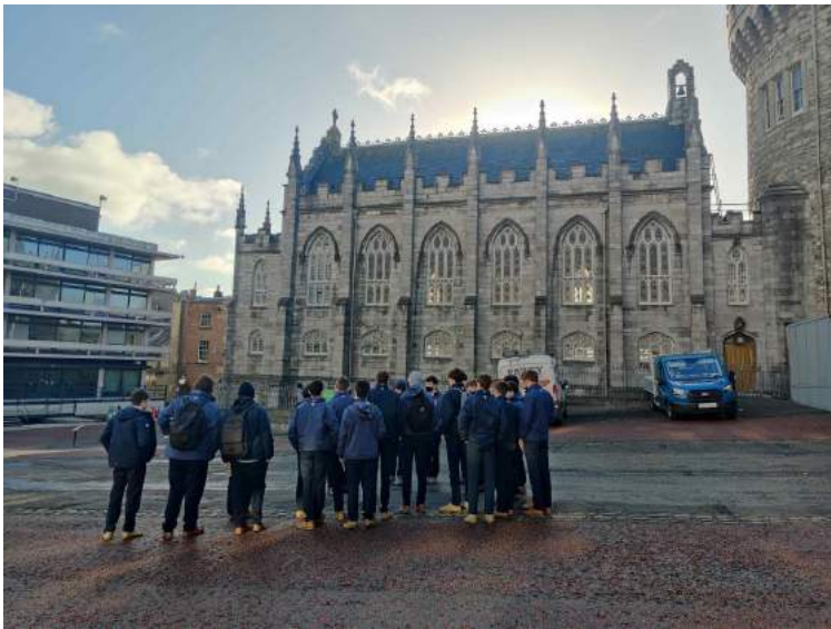
TY students visiting Dublin Castle