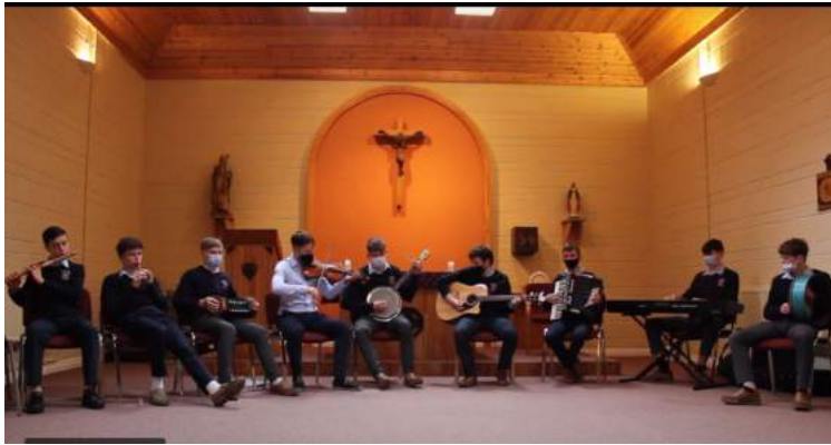
An Uaimh playing for our Advent Service