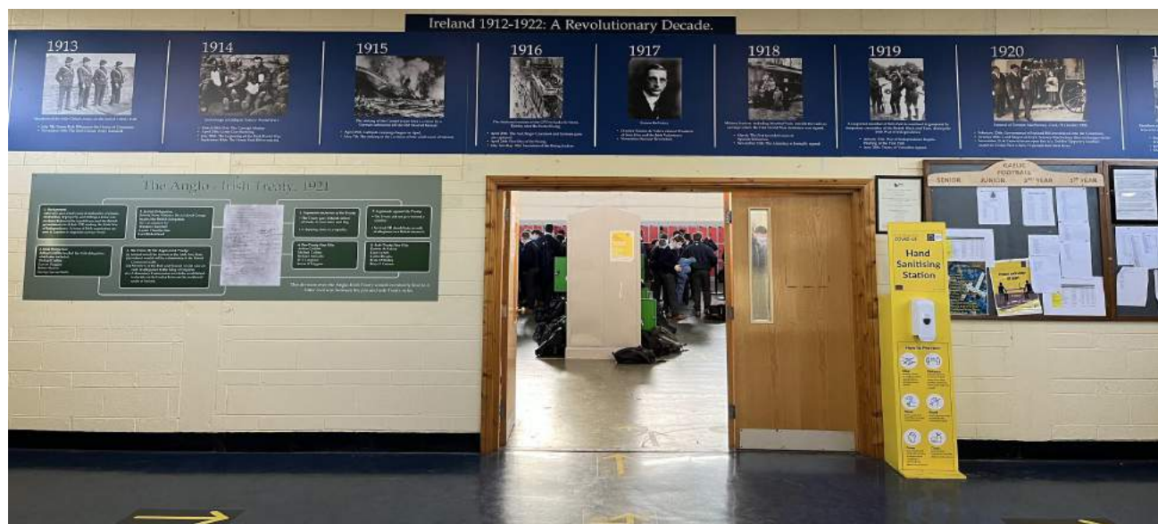
100 year timeline in the school main hall.